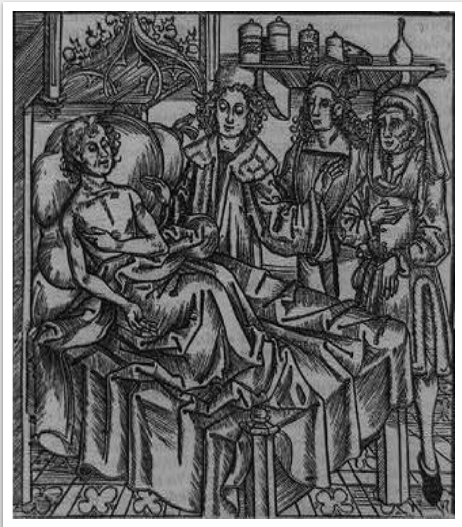
Illustration of plague victim published in 1500