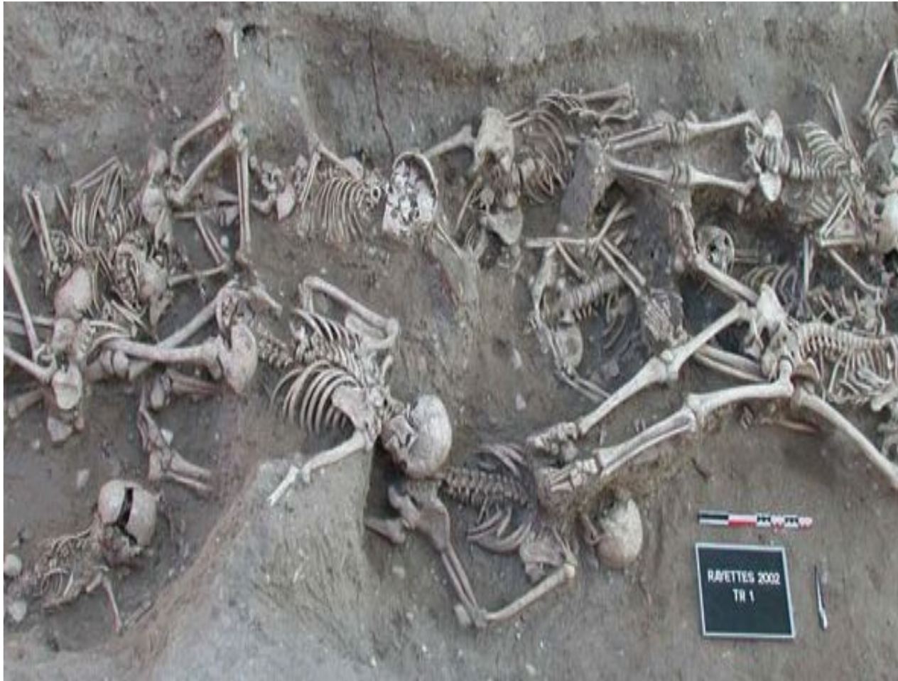
Excavated Mass Grave of Plague Victims Martigues, France