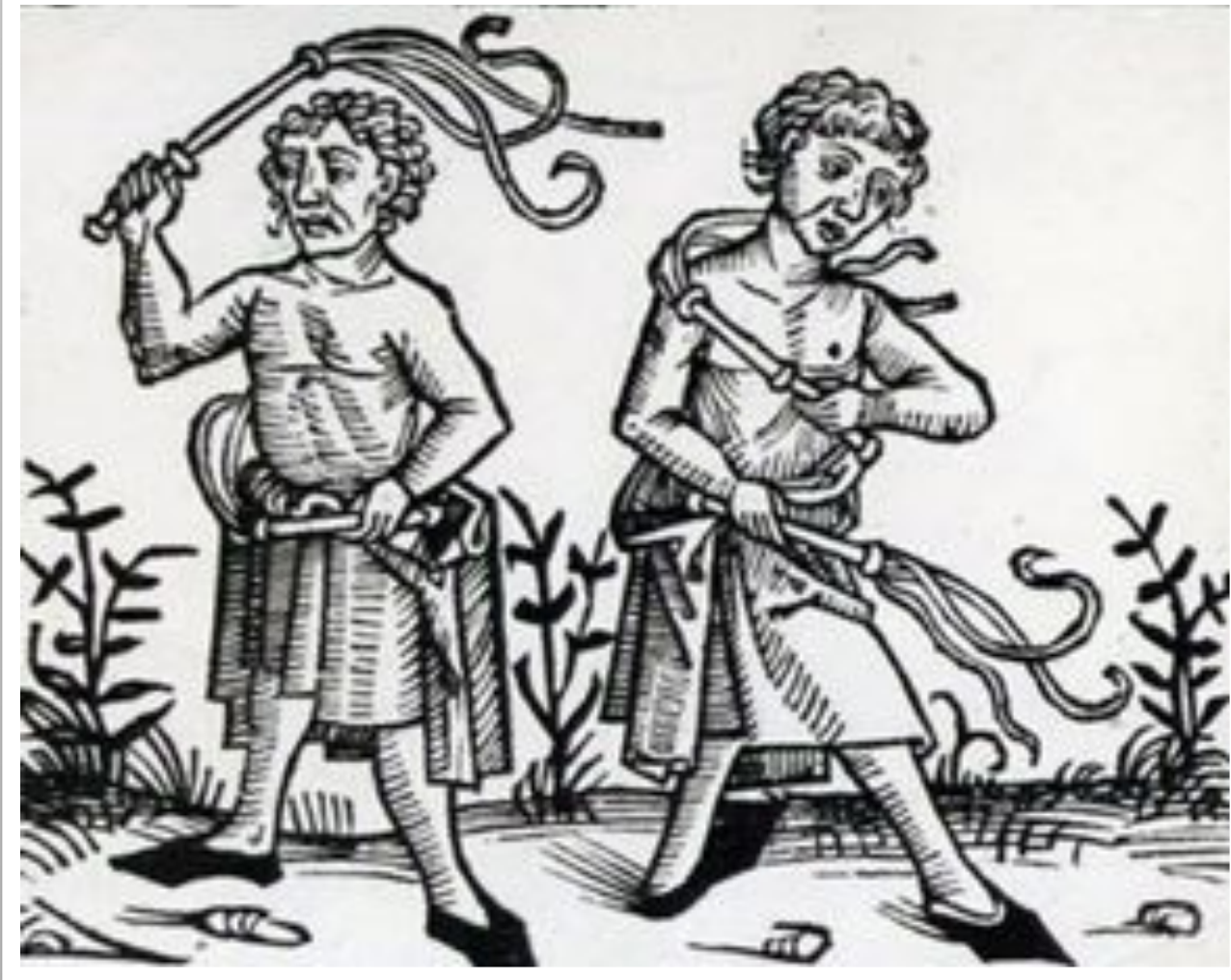
Flagellants from a 15 th Century Woodcut